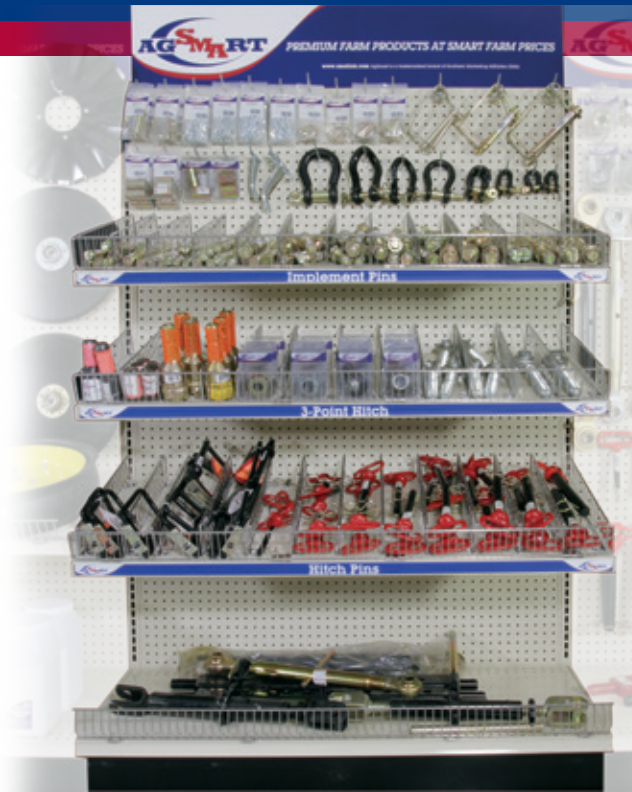
3-Point Hitch (Shelved)