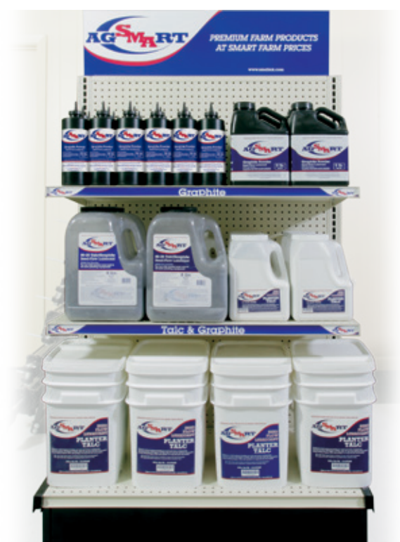
Seed Planter Talc/Graphite