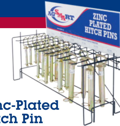
Zinc-Plated Hitch Pin