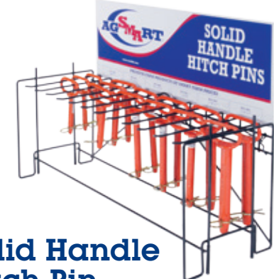
Solid Handle Hitch Pin