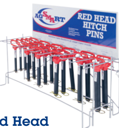
Red Head Hitch Pin